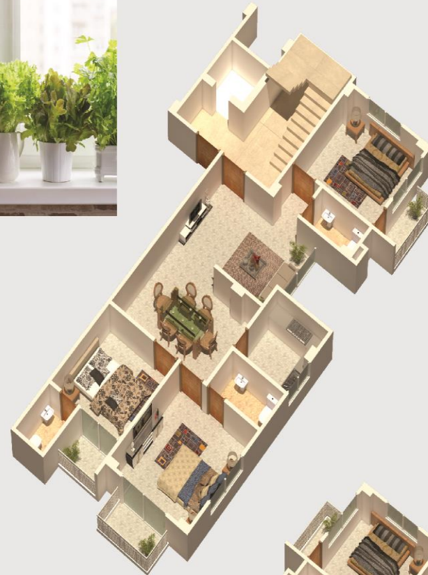
Type-A | 3D Flat Size: 1250 sq.ft.