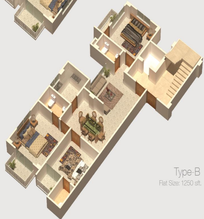
Type-B | 3D Flat Size: 1250 sq.ft.